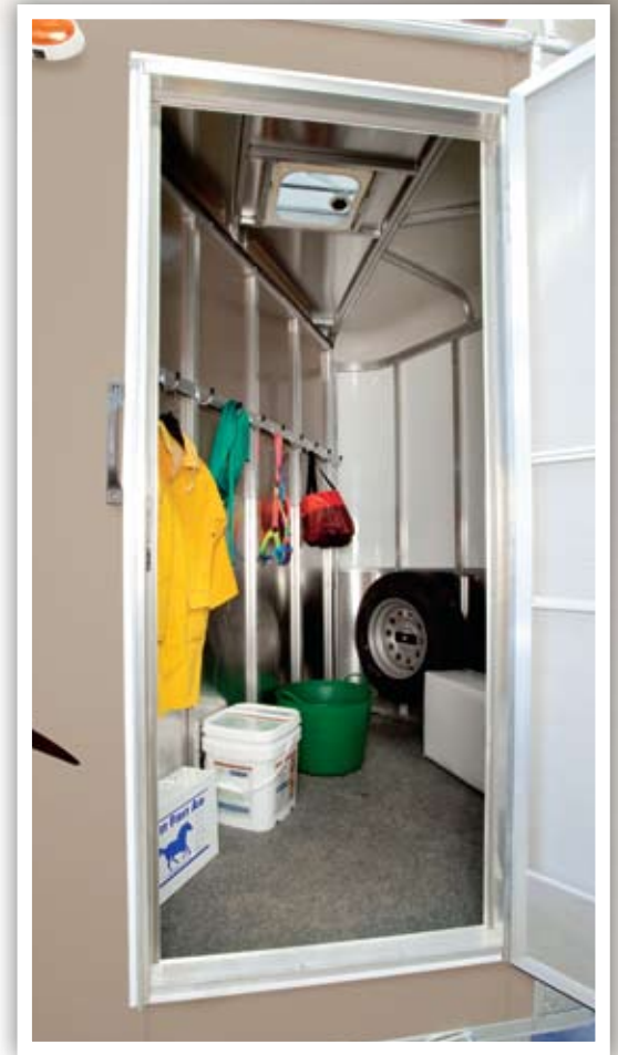
Standard dressing room shown